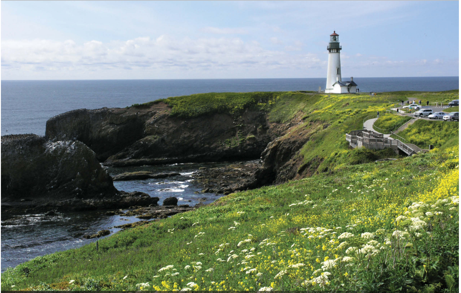
Yaquina Head Lighthouse on Oregon's dramatic coastline