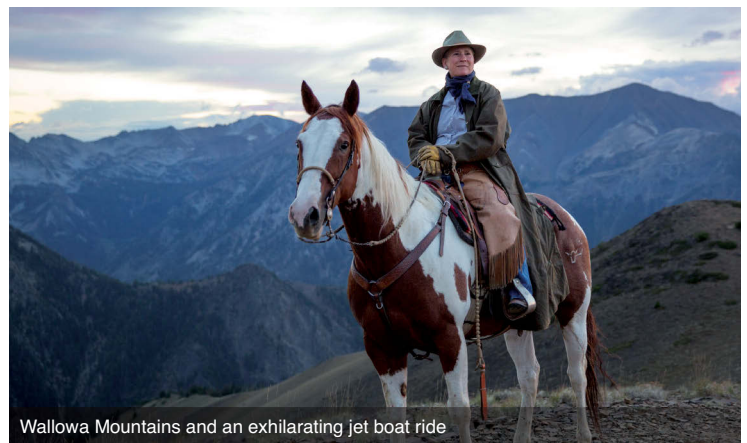
Wallowa Mountains and an exhilarating jet boat ride

Depart for home from this memorable vacation with a group transfer to the Portland International Airport at 8:00 a.m. for flights out after 12:00 p.m. (Breakfast)