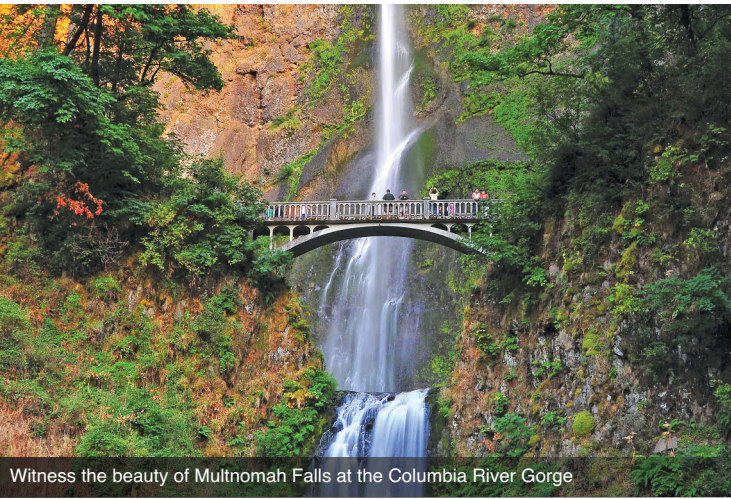
Witness the beauty of Multnomah Falls at the Columbia River Gorge

Falls, experience the power of this 600-foot tall roaring cascade of water which legend says was created to win the heart of a young princess who wanted a private place to bathe. We also stop at mammoth Bonneville Lock and Dam before returning. (Breakfast)