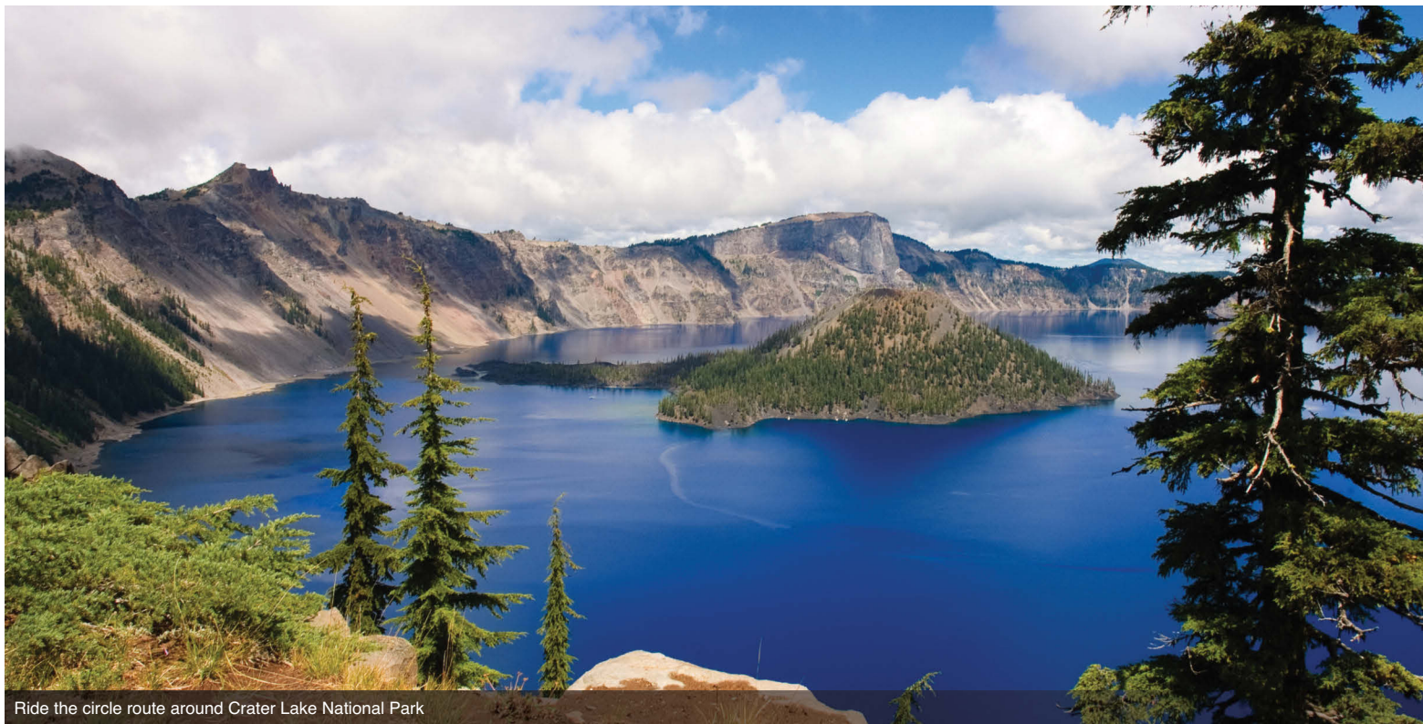
Ride the circle route around Crater Lake National Park