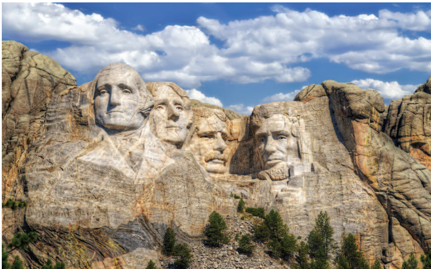
Four remarkable Presidents look at us from their perch on Mt. Rushmore