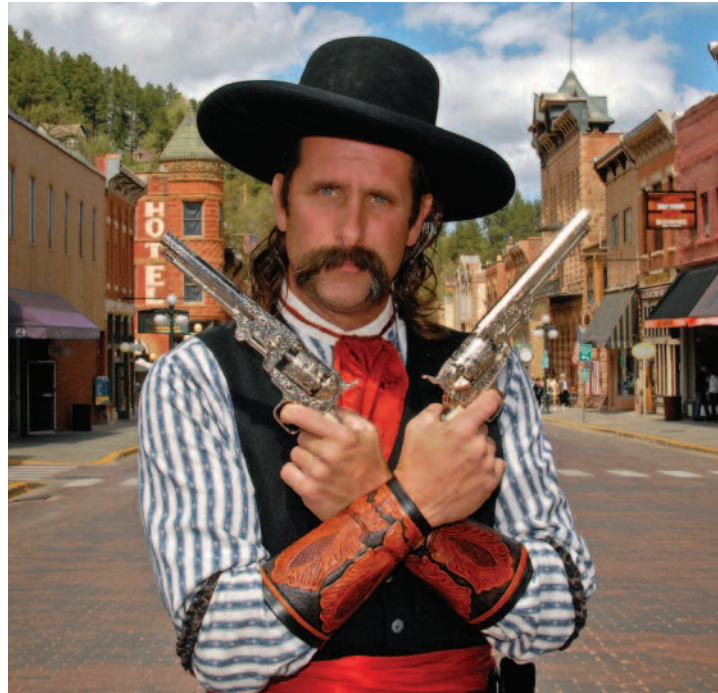
See cowboys and Boot Hill in Deadwood, South Dakota