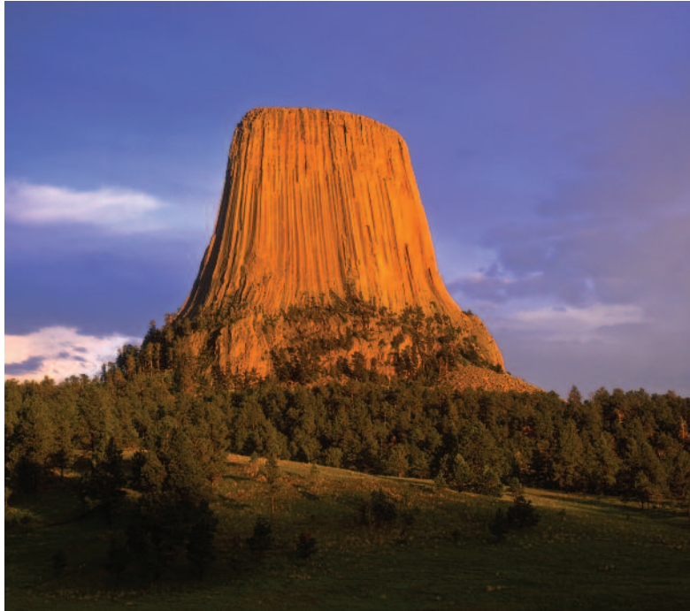
A "close encounter" awaits us at Devils Tower