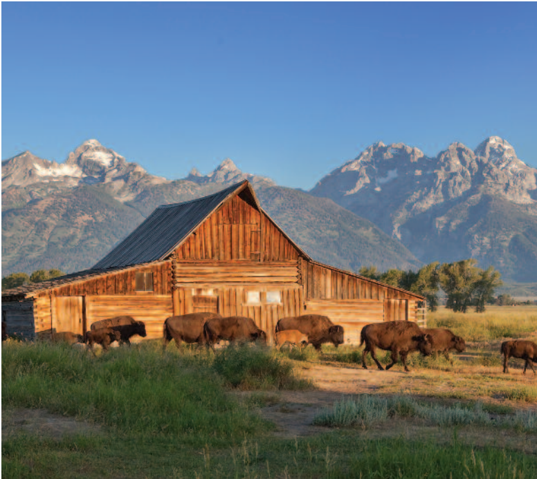
Bison roaming through picturesque Grand Teton National Park