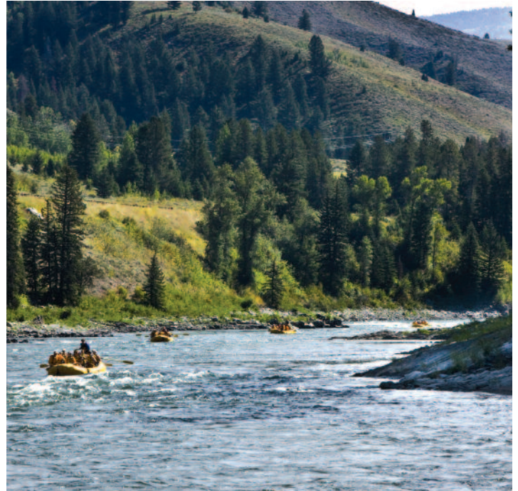
Thrill to a Float Trip on Snake River

Bill Historical Center, you'll encounter some of these historic figures, including Bill himself, the renowned sharpshooter Annie Oakley and Indian chief Sitting Bull before we arrive in Yellowstone National Park, our home for the next two nights. (Breakfast)