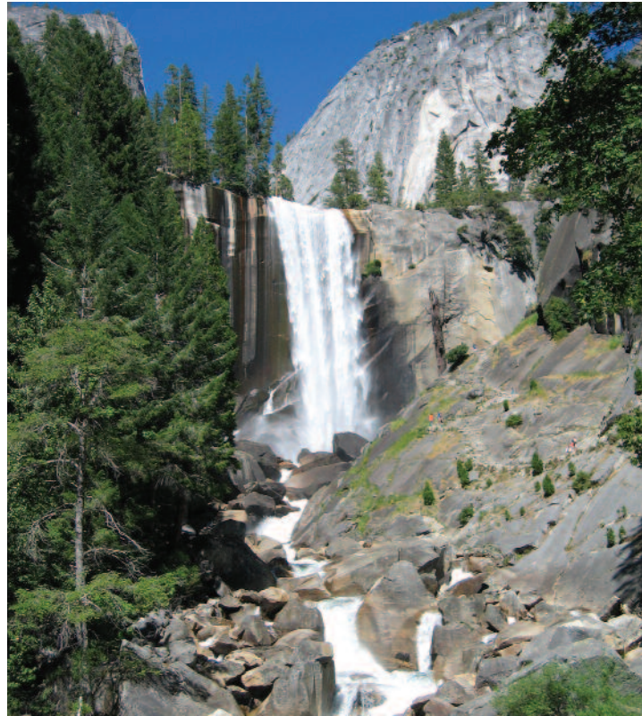
See the breath-taking Yosemite Falls