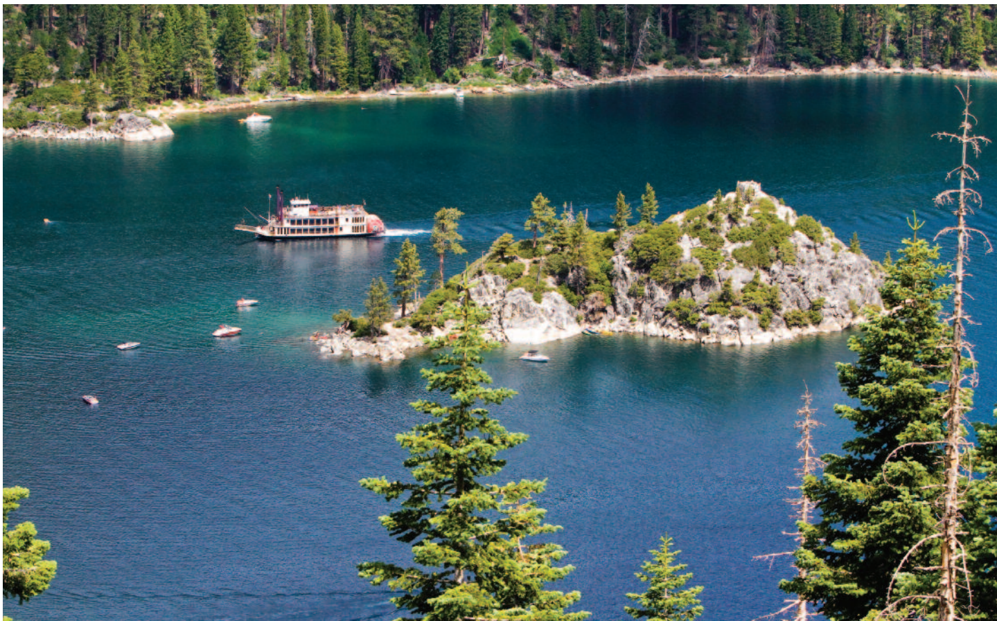
Cruise the crystalline waters of Lake Tahoe aboard the MS Dixie II