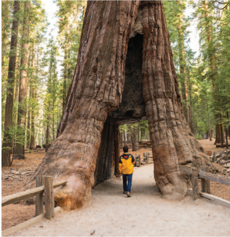
Visit Mariposa Grove and see the Giant Sequoias